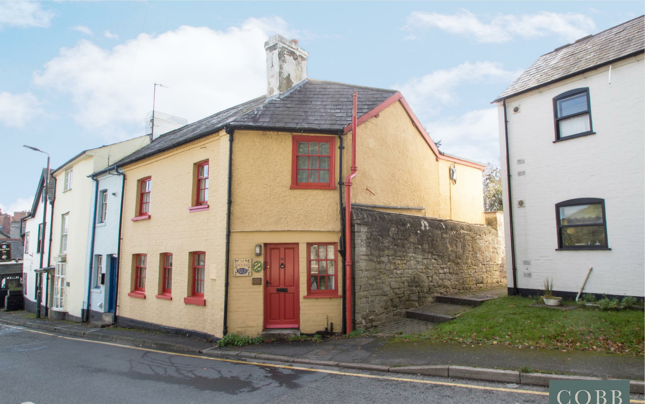
21, Church Street, Kington, HR5 3BE Guide Price £95,000